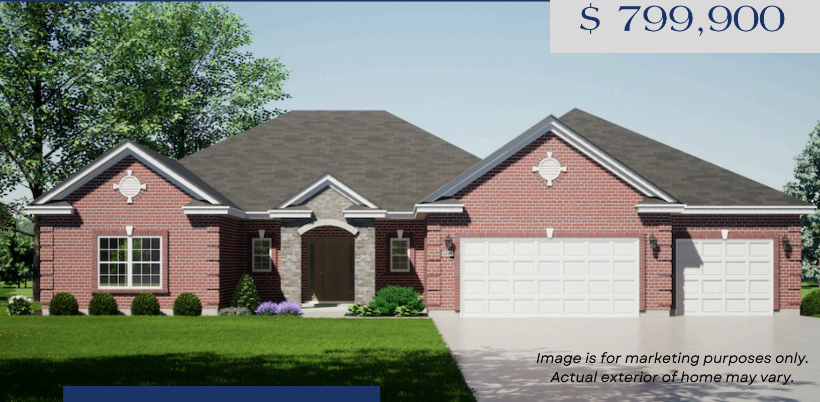
Image is for marketing purposes only. Actual exterior of home may vary.